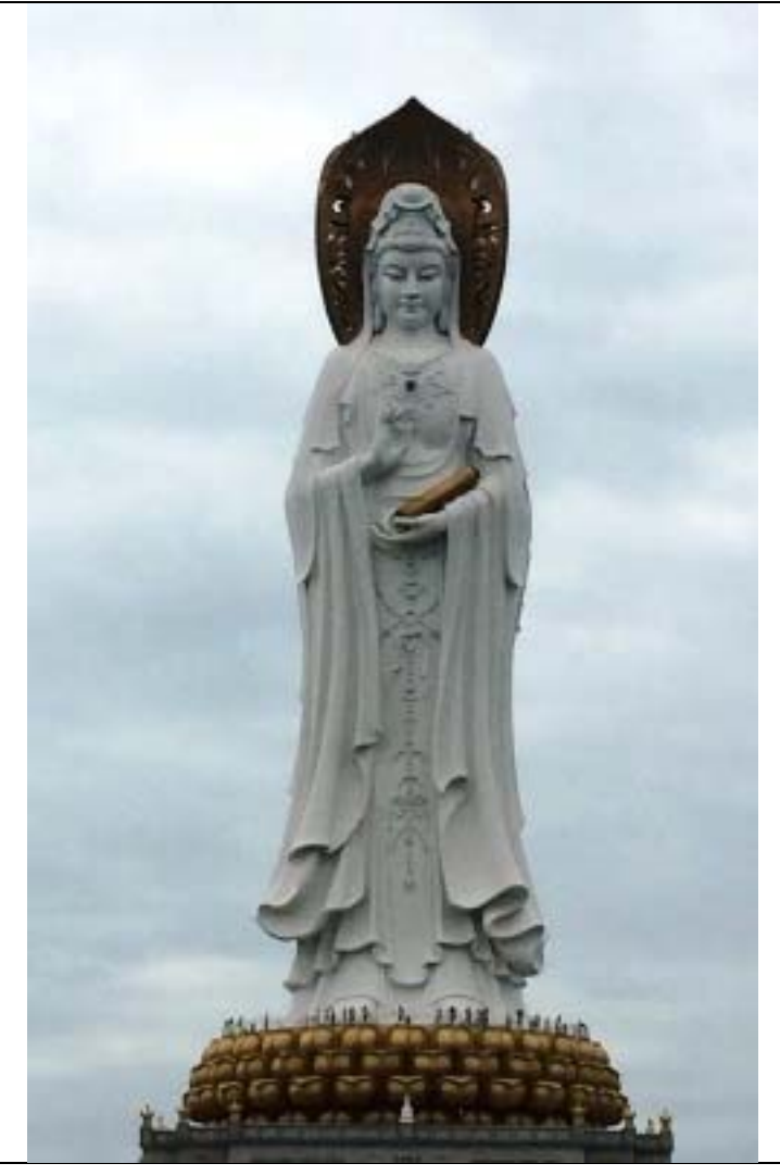
海南三亞南海觀音 The Guanyin Statue in San Ya, Hainan, People's Republic of China