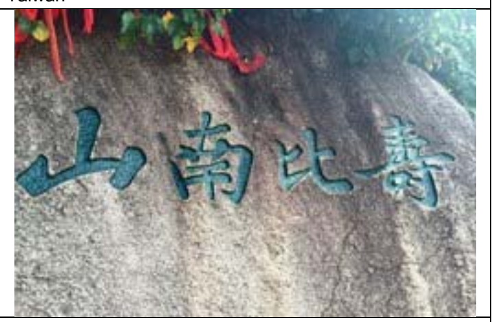
恭祝老法師以及所有長輩:壽比南山 Long live wish to Master Chin-Kung and all seniors