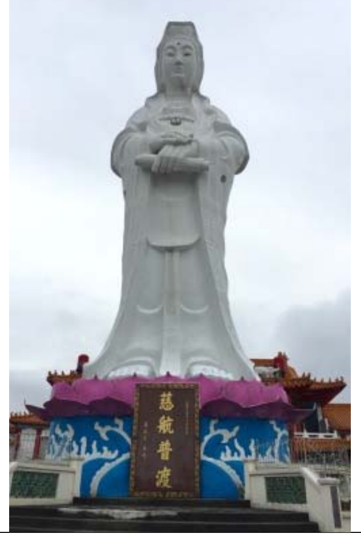
台灣基隆市中正公園山頂的觀音慈像 The Guanyin Statue in the Chung-Cheng Park, Keelung, Taiwan